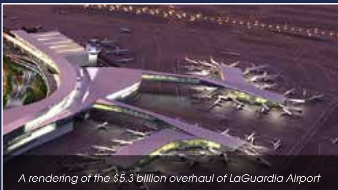
A rendering of the $5.3 billion overhaul of LaGuardia Airport