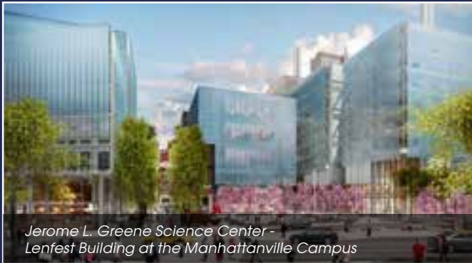
Jerome L. Greene Science Center - Lenfest Building at the Manhattanville Campus