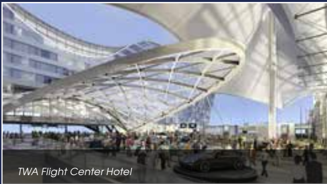
TWA Flight Center Hotel