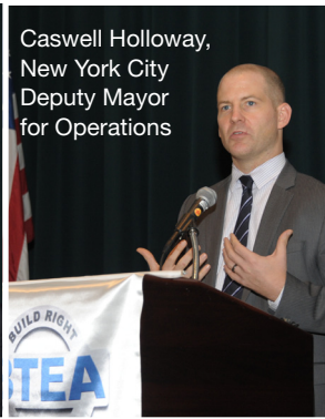
Caswell Holloway, New York City Deputy Mayor for Operations